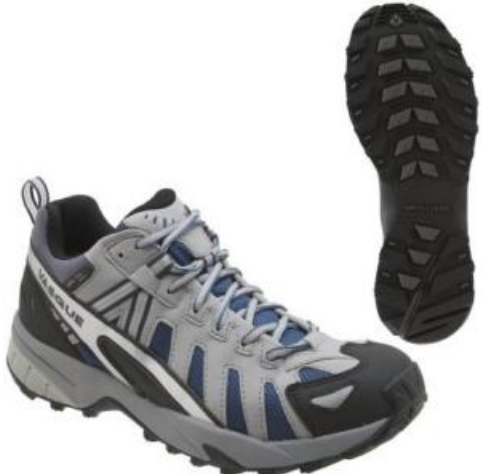
Vasque "Blur" Trail Running Shoes

road-racing flats or soft, non-protecting road running shoes. Most of them end up with lost toenails, as well, (because the toe-box on these shoes is real tight). Unless you are a really fast & fluid trail runner, or a "World-Class" trail runner, I would not opt for trail-running shoes on any trail ultra, trail marathon, or trail race.