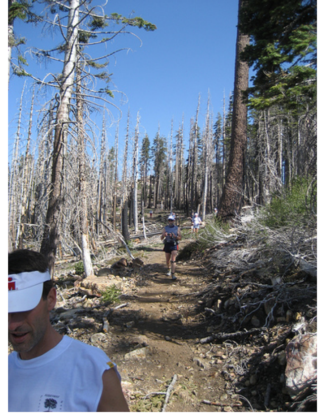
Training run on the Western States 100 Trail.

If you get blisters or black toenails every time you run a race...change something...anything, darn-it! On a recent 3-day training run on trails through the Sierra Nevada Mountains in May 2007, I didn't have a problem. Lots of other folks did. On the first day, we ran 34 miles of technical trails in the mountains. We had 3 major (40-minute) steep decents, and 3 major (one-hour) steep climbs throughout the day. Half of the "first day folks" had major problems with feet and leg issues, and most of them dropped out of training camp. It was easy to see what they were doing wrong, in most cases. The "toenail losers," "ankle twisters," and folks that got "stone bruises" were always wearing "normal" road running shoes or racing flats, instead of trail-running shoes. And most of the blister folks didn't have their shoes tied tight enough, or didn't know anything about electrolyte consumption or foot care.